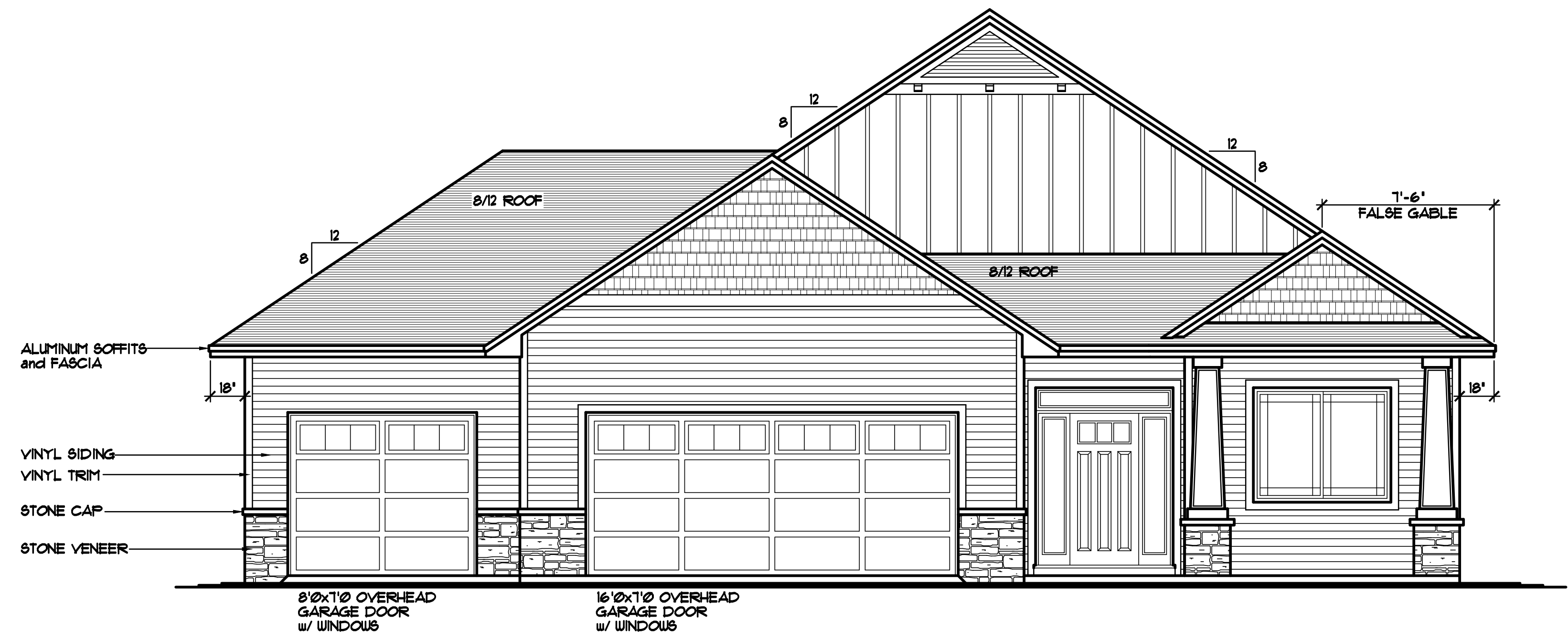
FRONT ELEVATION 1/4"=1'-0" 1564 SQFT. MAIN LEVEL

THE: BRYAN PLAN 26541 FRONTIER AVENUE LOT 2, BLOCK 2, KENNEDY ESTATES WYOMING, MN